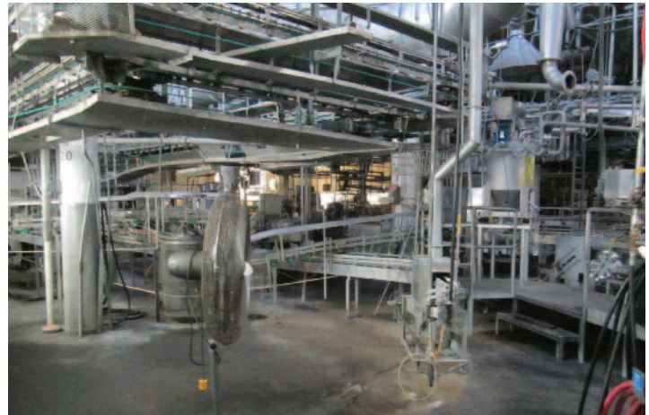
Appraising manufacturing facilities is a highly specialized project. Consider the cooling tubes in a soup processing plant pictured above. What is the value of the pipes in an active food processing environment versus disassembled as used pipes or scrap metal.

Jack recently appraised the 129-acre Campbell Soup facility in Sacramento, CA. This facility, with 1.6 million square feet under roof, and a total of 12 processing lines, was the company's oldest functioning food processing facility. After a 60-year run, the south Sacramento factory closed last year. The equipment valuation focused on two main areas. The first was the